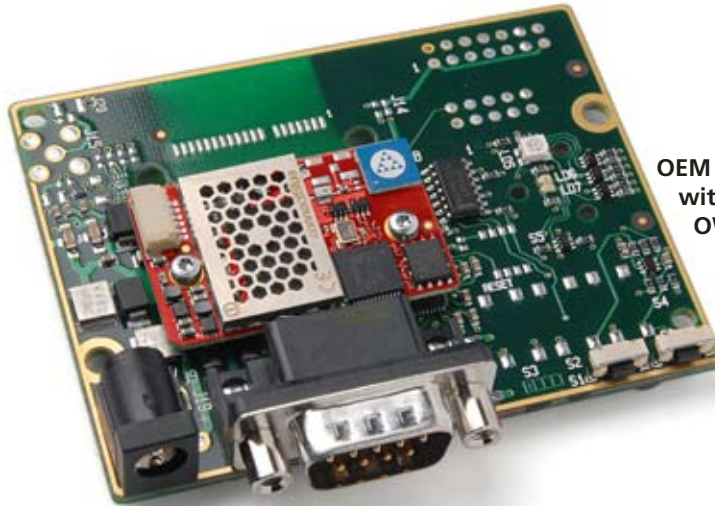
OEM RS232 Module Adapter III with Wireless LAN module OWSPA311gi